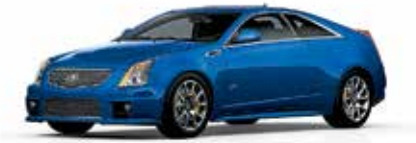
OPULENT BLUE METALLIC